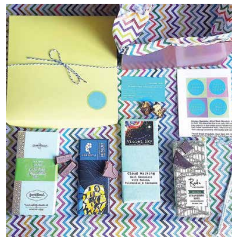
(Top photo) Cacao at Violet Sky Chocolate from Cacao Verapaz in Guatemala. (Bottom photo) Chocolate Uplift chocolate subscription box.